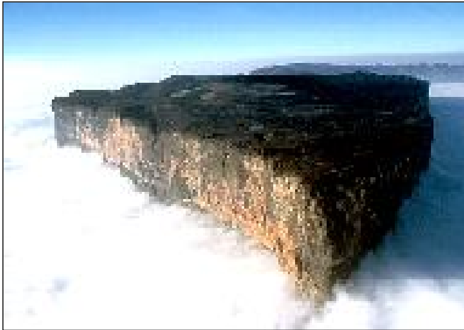
Island in the sky

It is often called the Lost World. The Eastern part of Venezuela is indeed rich in fantasy and adventure. The dramatic sandstone mesas here are called Tepuis 1 (table-top mountains). They are ancient even by geological time. The sandstone, as discovered by scientist, is at least 1.8 billion years old. These mountains, often wrapped in spun-sugar clouds, fringed with the exotic foliage of the tropics, and fractured by hundreds of waterfall. The summit of many Tepui remains inaccessible even today. Their sheer cliffs not only keep invaders out, but also act as prison walls for many species that can survive in such a rarefied atmosphere. Here in this jungle heartland, you can find species that go back to the period when South America and Africa was one continent. At the summit's plateau, you will encounter one of the world's most unique landscapes – strange rock formations, carnivorous vegetation, and mysterious pools.