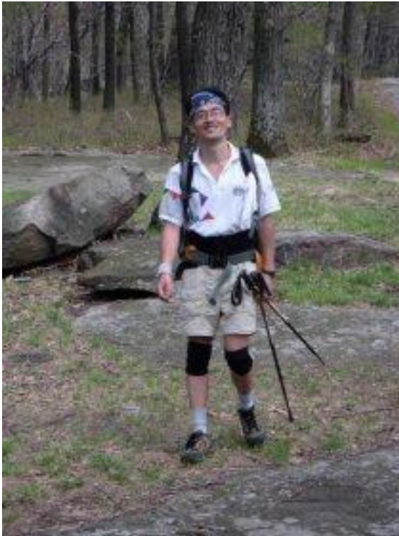
Wade: "Oh, I am tired, but looking good right ?"